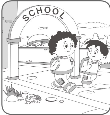
Jack is coming back home.