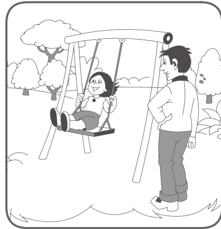
Carol enjoyed the swing ride.