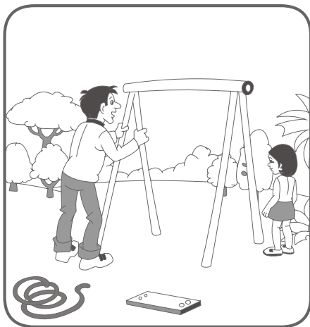
Father started building the swing.