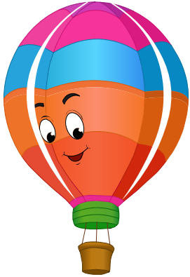
Hot air balloon

Circle the vehicles used for road transportation.