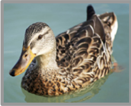
D uck _ _ _

Fill in the blanks and complete the names of the animals.