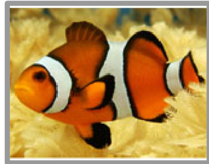
F ish _ _