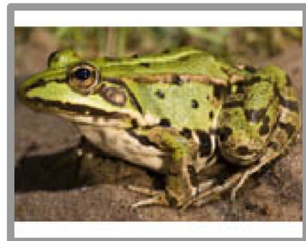
F rog _ _ _