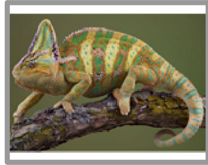
C hameleon _ _ _